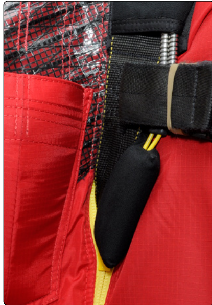
Handles completely exposed. Zippers tight against MLW.

NOTE: If you think that the zipper system is not functioning well with your skydive harness (i.e. your emergency handles are not always 100% accessible), please contact us immediately before your next jump. You may need to modify the zippers so that the sliders stay locked in place, as per the information at this URL: http://squirrel.ws/zipperstuff